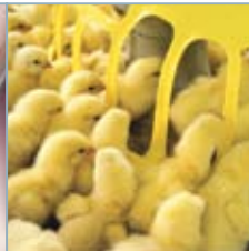
HAIKOO™ oval pan feeding system for broilers.