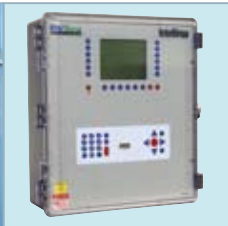
INTELLIGRO® complete house controller.