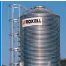
FRESH COMBINATION™ complete range of galvanized feed bins.

Our entire range includes feed bins; feed transport systems; and feeding, drinking, ventilation and control systems for poultry.