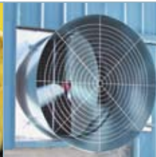
ProTerra® fans, winches, inlets and evaporative cooling.