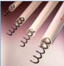
FLEX-line™ complete range of feed transport systems.