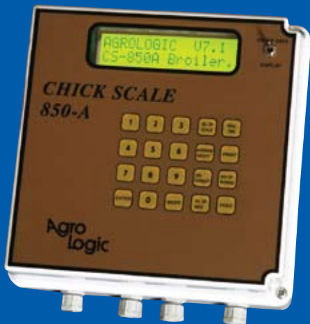
Agro Logic® Chick Scale 850

Leading in the development of electronic control systems for poultry since 1988.