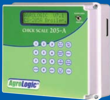
Agro Logic® Chick Scale 205