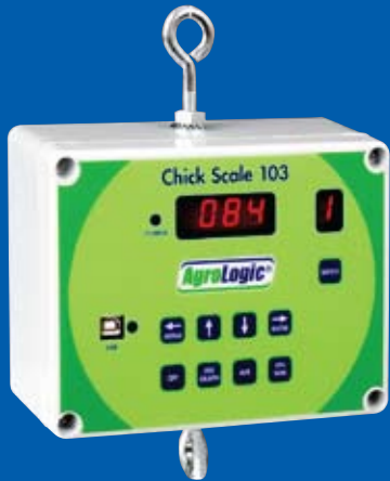
Agro Logic® Chick Scale 103

Leading in the development of electronic control systems for poultry since 1988.