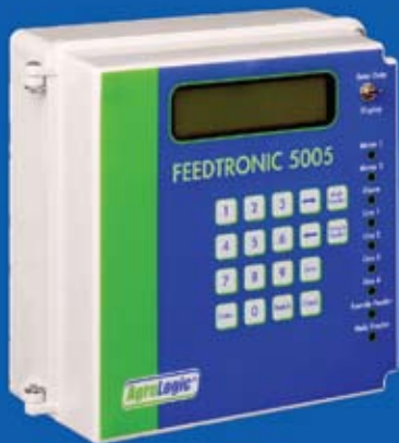
Agro Logic Feedtronic™ 5005