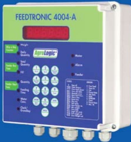
Agro Logic Feedtronic™ 4004-A